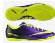
Indoor soccer shoes (two examples)